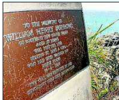
DARK HISTORY: The plaque in memorial of a drowning at the Mersey Bluff in 1929.