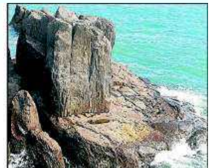
DANGEROUS AREA: The rock known as the Hat pictured from the Mersey Bluff lookout.